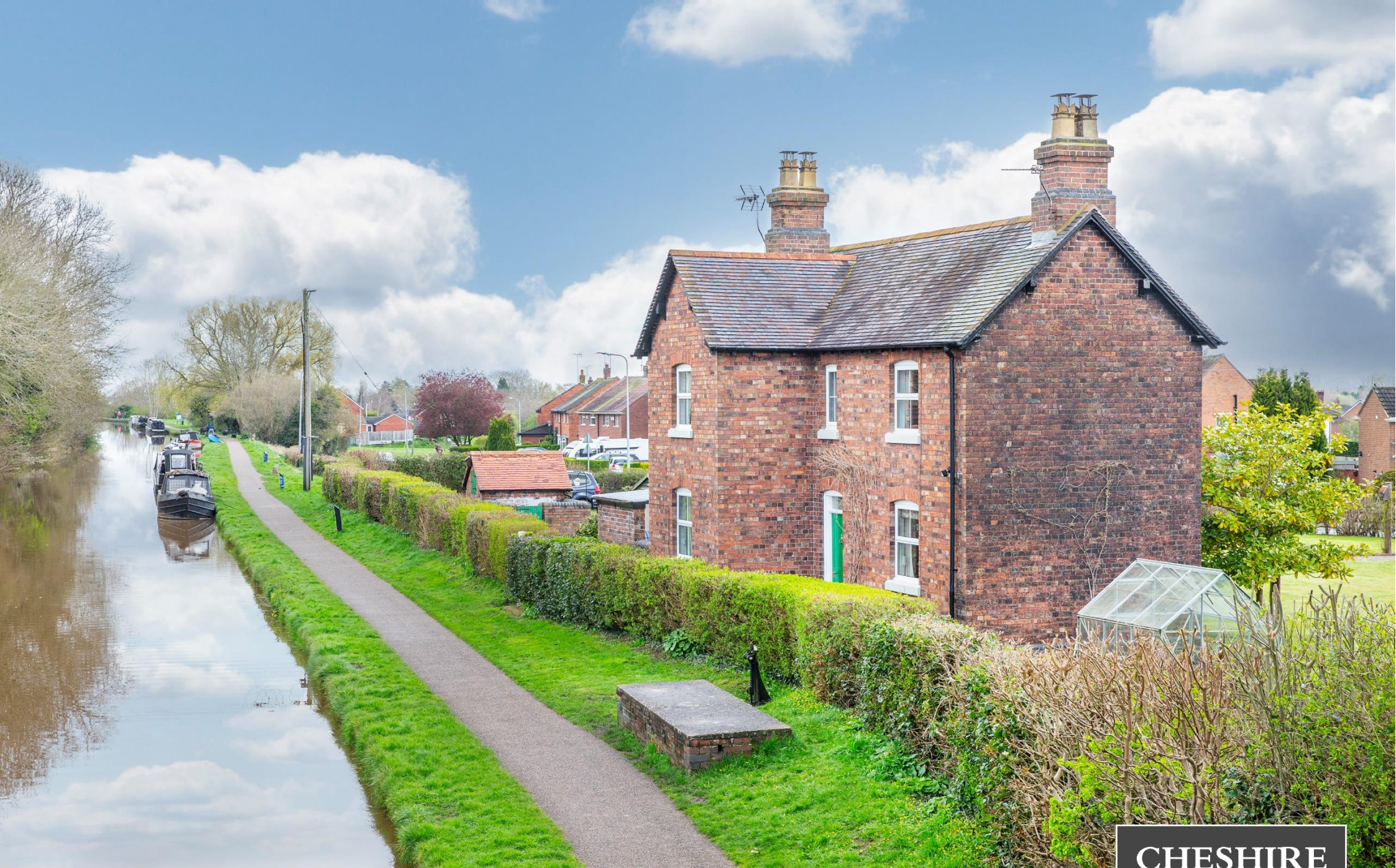
“Bridge House”, Marsh Lane, Nantwich CW5 5TH